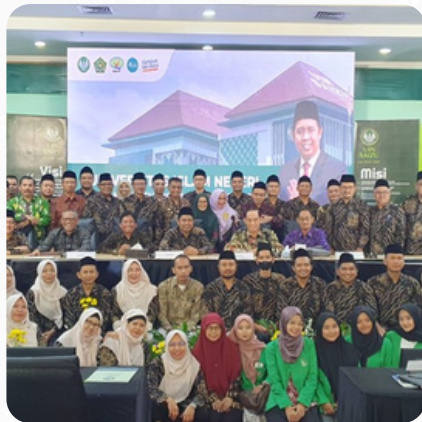
Workshop and Seminars