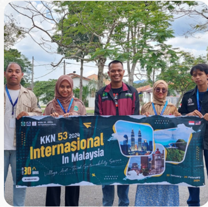
Outreach programs and community service