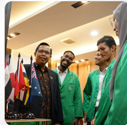
Orientation Program and Academic Advising