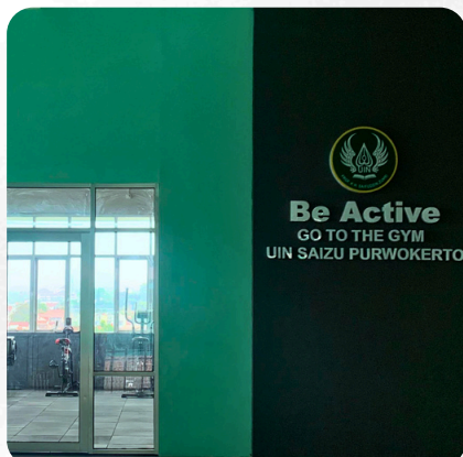
Gym and Sport Center