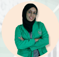
WIAM - YEMEN

"Learning Indonesian in BIPA program became very interesting with interactive coaches!!"