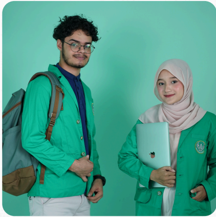
Scholarship for international Student