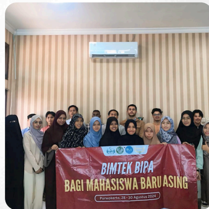
Indonesian Language Course ( BIPA )