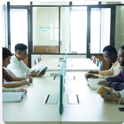
Extensive library with digital resources