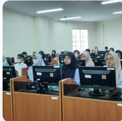
Research centers and laboratories